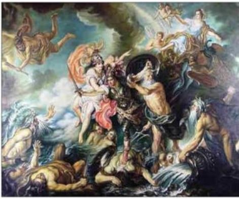
The Titanomachy, the Battle of the Titans