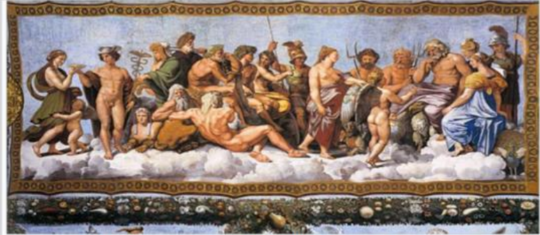
Assembly of twenty gods, predominantly the Twelve Olympians, as they receive Psyche (Loggia di Psiche, 1518–19, by Raphael and his school, at the Villa Farnesina)