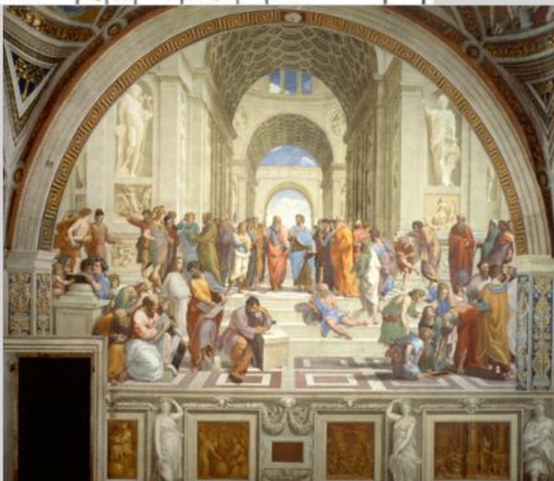
Raphael "The School of Athens"