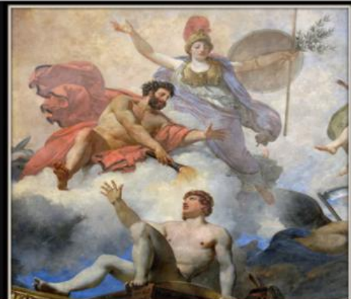
Prometheus creating man in the presence of Athena by Jean-Simon

Aeschylus in "Prometheus Bound" says And even more than that, I have given them the gift of fire