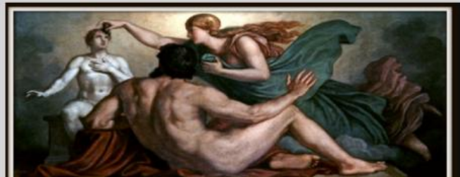
Prometheus watches Athena endow his creation with reason (painting by Christian Griepenkerl, 1877)